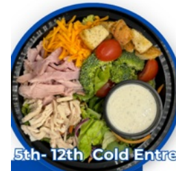
5th-12th Cold Entrée

Smokey D's goal is to help students stay focused and attentive in their classes, making it easier for teachers to deliver lessons and engage with their students. When students are properly nourished, they are more likely to participate