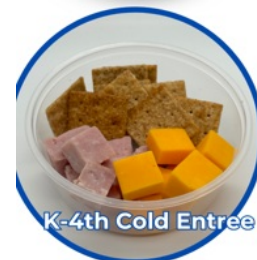
K-4th Cold Entrée